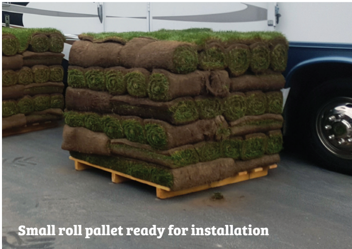
Small roll pallet ready for installation