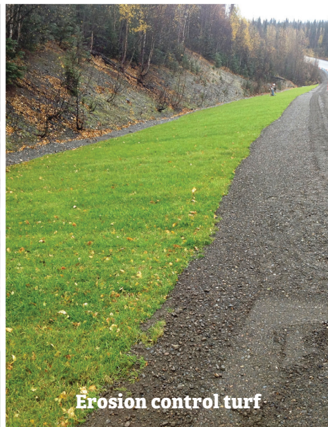
Erosion control turf