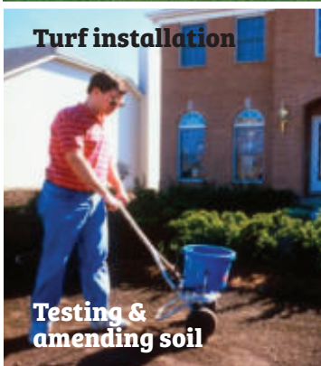
Turf installation Testing & amending soil