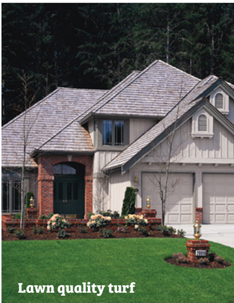
Lawn quality turf