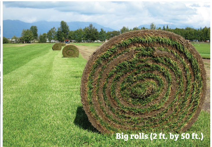
Big rolls (2 ft. by 50 ft.)